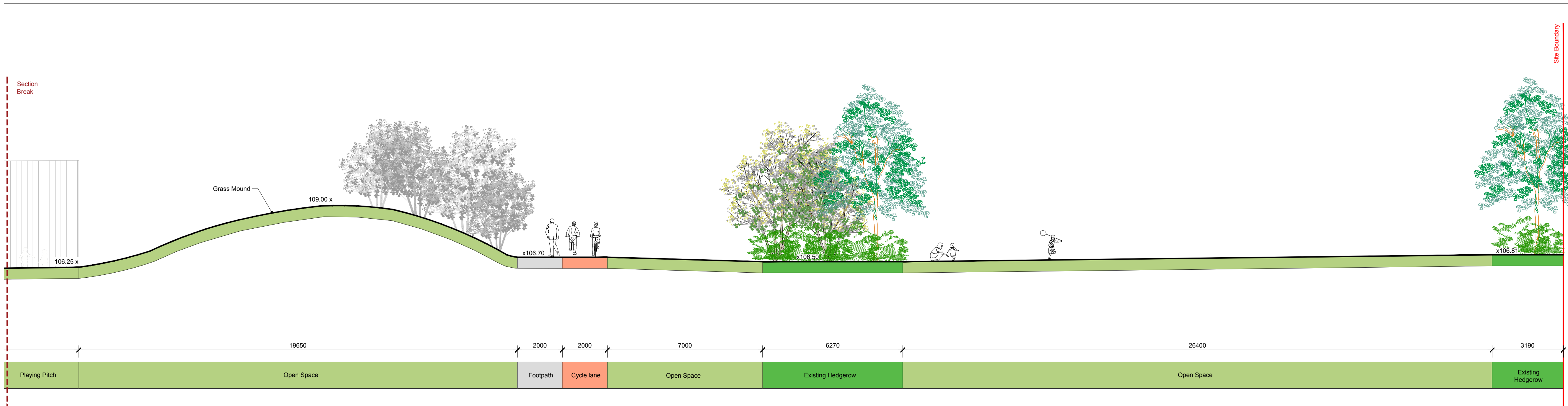
Section FF' (3/3) - Scale 1/100